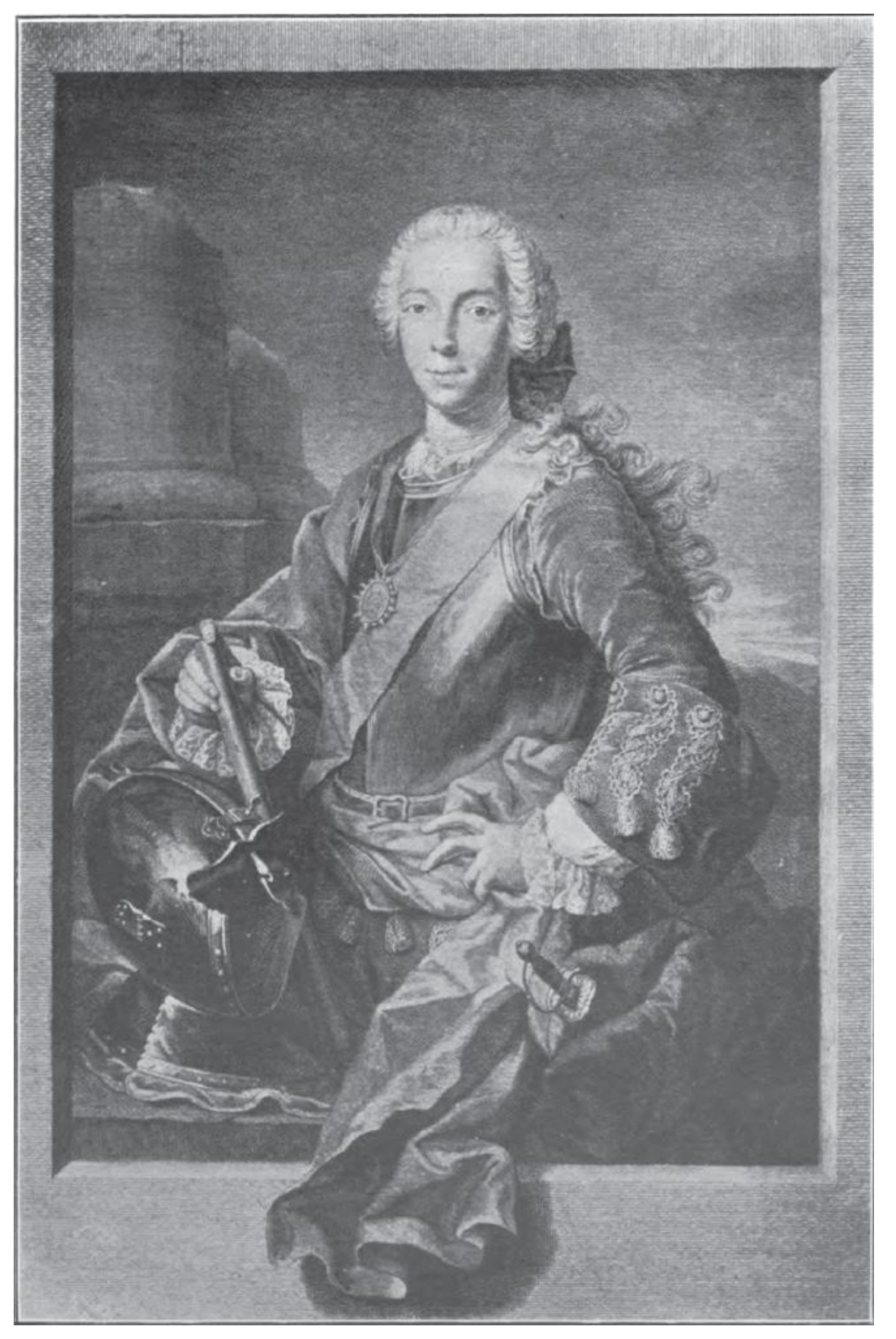
PORTRAIT OF PRINCE CHARLES EDWARD